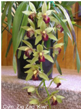
Cym. Zig Zag 'Kiwi'