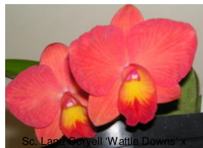
Sc. Lana Coryell 'Wattle Downs' x soph. brevipedunculata