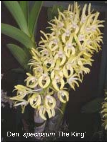
Den. speciosum 'The King'