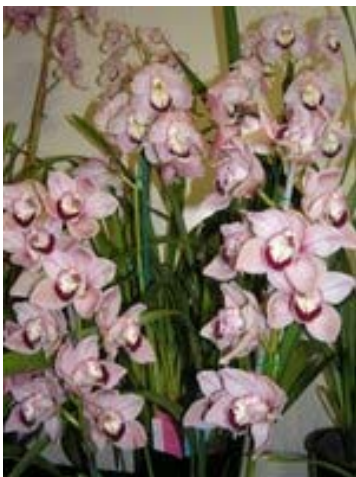
Cym. Lady Kim 'Blushing Bride'