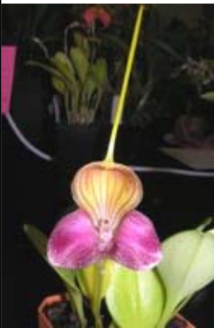
Masd caudata 'Seven Oaks'