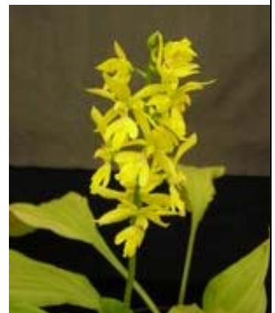
Calanthe sieboldii 'Kaurakami'