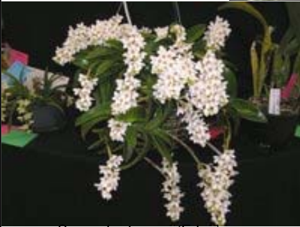
Sarco. hartmannii 'Edna'