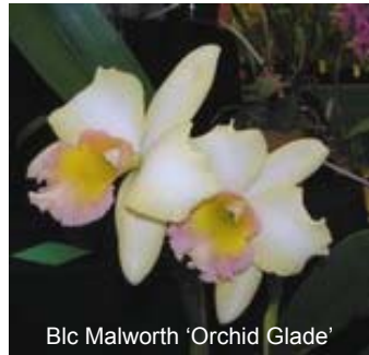
Blc Malworth 'Orchid Glade'