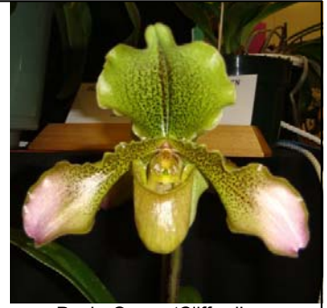
Paph. Orewa 'Clifford'