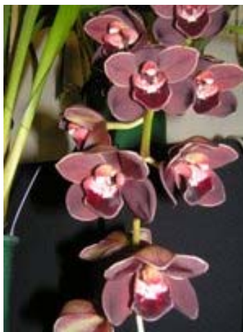
Cym. Last Tango 'Geyserland'